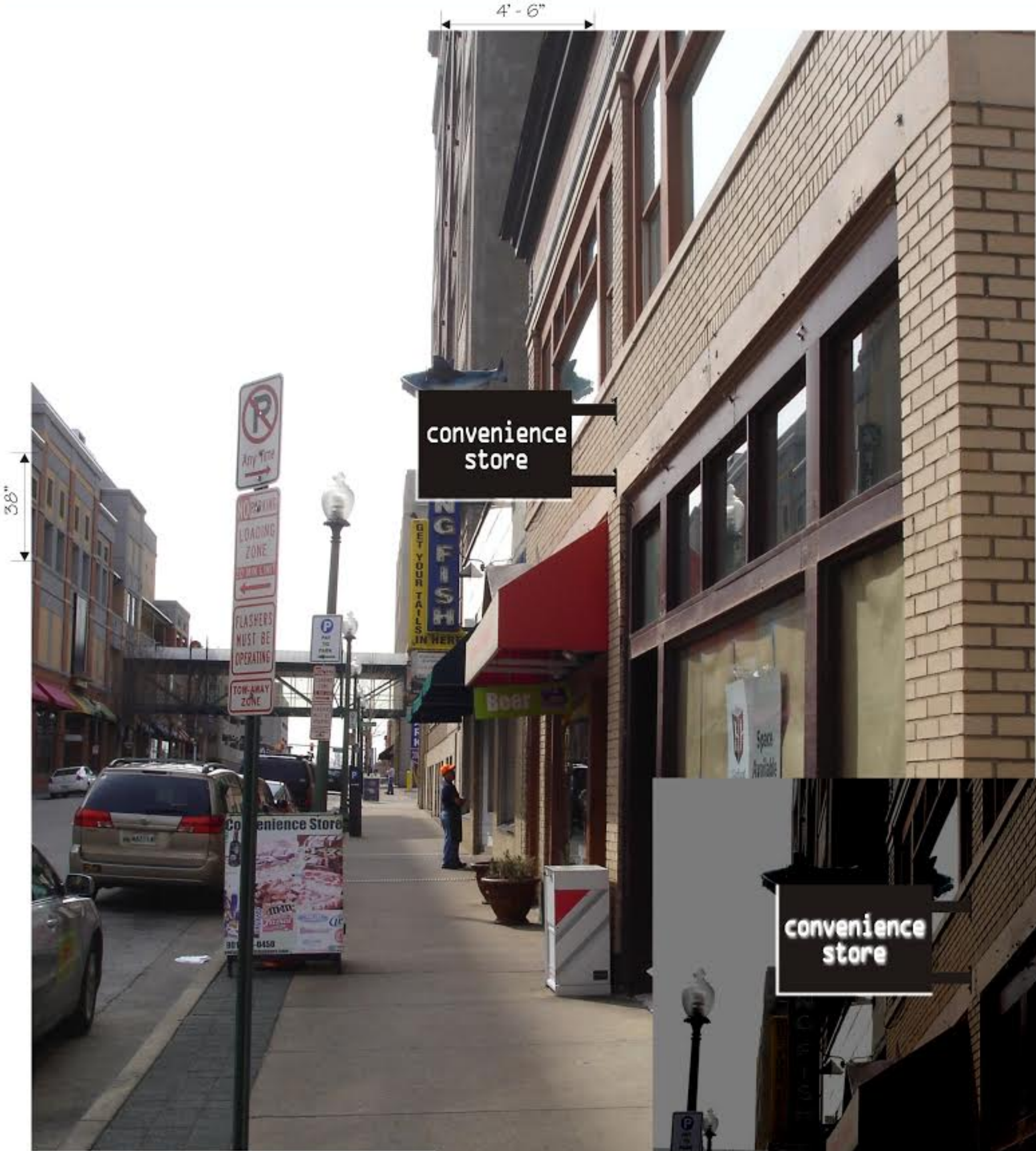
DOUBLE FACE ALUMINUM SIGN CONVENIENCE STORE ROUTED W/ PUSH-THRU COPY & COPPER VINYL OVERLAY INTERNAL LED ILLUMINATION