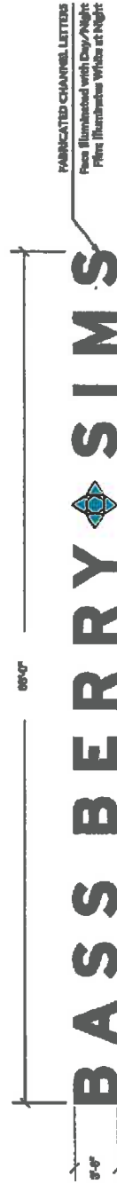
FABRICATED CHANNEL LETTERS Faces Illuminated with Day/Night Plates Illuminated White at Night

PLEASE NOTE: CODE ONLY ALLOWS 40% OF SIGNABLE AREA PER FACADE.