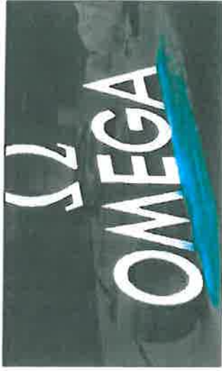
1 REFERENCE IMAGE SCALE: NTS